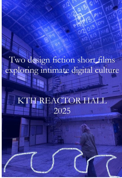
Two design fiction short films exploring intimate digital culture